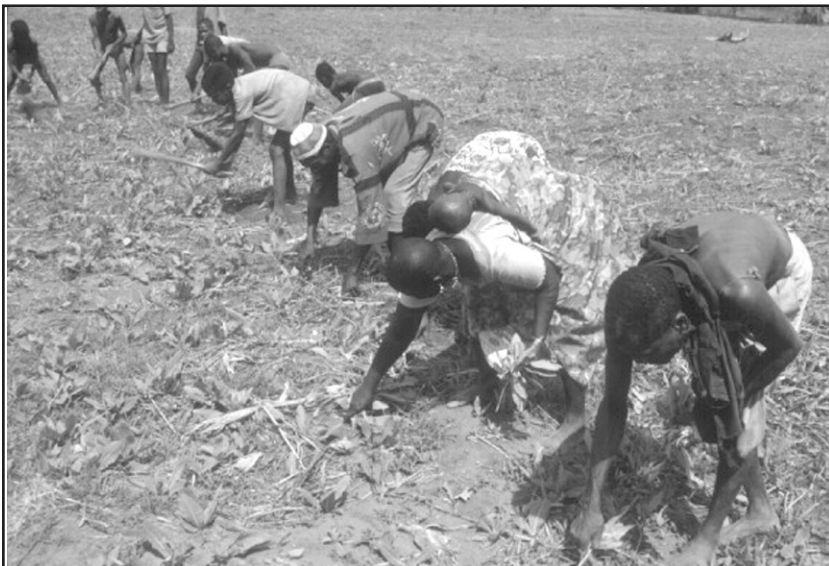
Most of the food needed to meet increased needs in the next 25 years must be produced in tropical and subtropical farming systems. We know that these systems are complex, highly heterogeneous, fragile, generally low in productivity, and dominated by small-scale, poor farmers.